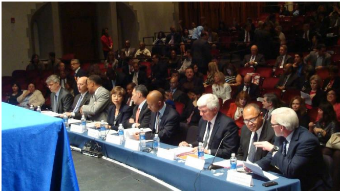
Ten CEOs appearing before the CPUC to discuss progress in diversity