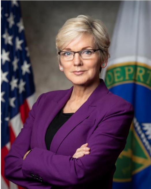
Jennifer Granholm U.S. Secretary of Energy Department of Energy